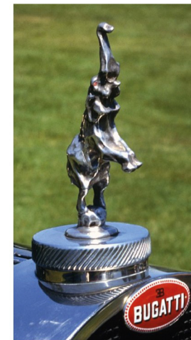
Bugatti elephant 1929