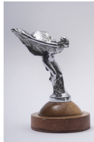
Spirit of Ecstasy