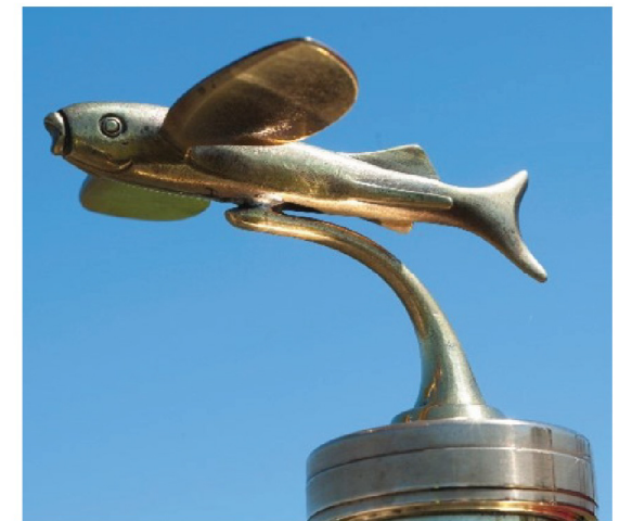
1909 Paterson Flying Fish

Have fun and don't forget to share your creations with us on Twitter or Facebook using #NMMCreative